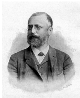
Figure: Eduard Weyr